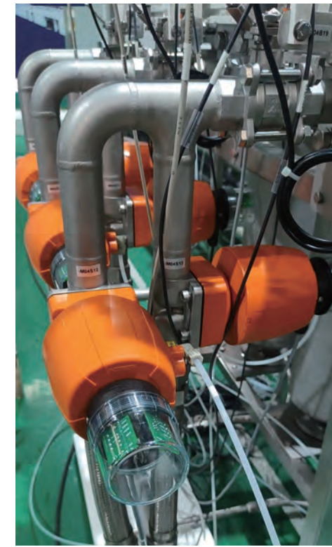
Biopharmaceutical: application in process systems