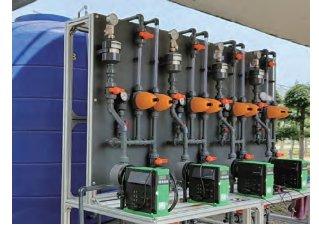
Dosing system: widely used in new energy, food, beer and beverage