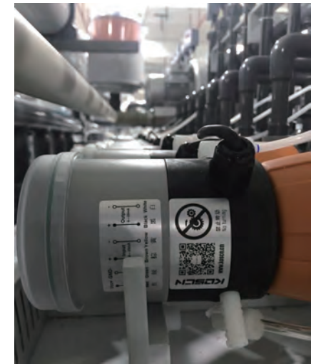
PCB: DES、SES、OSP、Developing Machine and other equipment are widely used