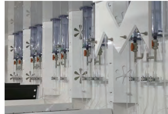
PV: Widely used in Texturing and etching equipment