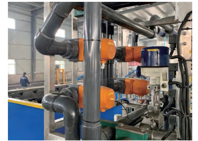
Water treatment: pure water, wastewater and leachate systems