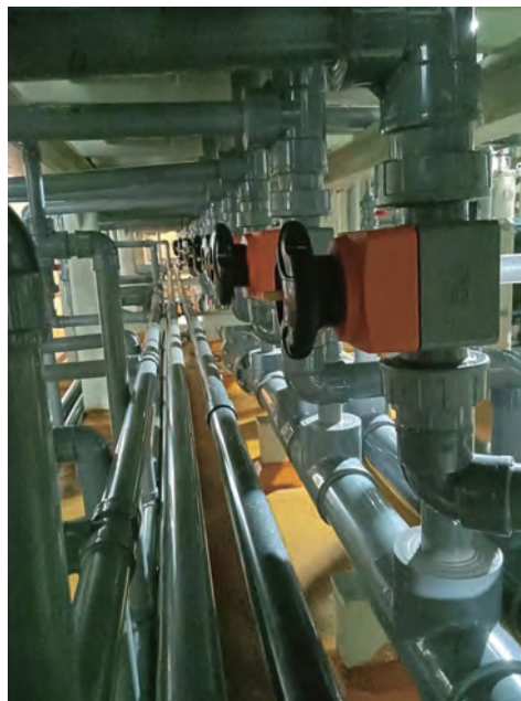
Aluminum foil and Copper foil: Filtration system