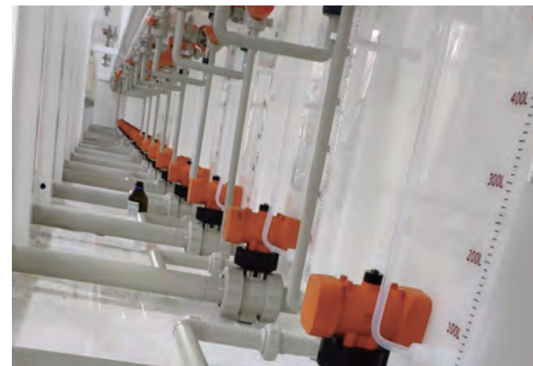
Glass panels: valve applications for cleaning equipment