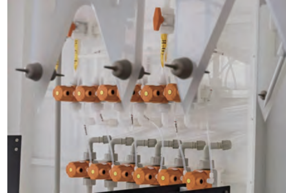
New material: silicon material cleaning equipment