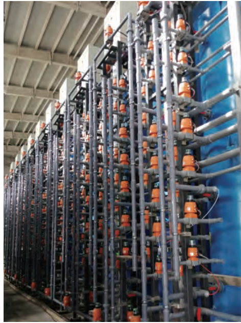
Biological fermentation: Valve array of ion exchange system

我們的產品廣泛應用於半導體、玻璃面板電鍍、光伏、垃圾液線路板、冶金、鋼鐵、水處理、化工、食品、飲料、電力、造紙、生物制藥以及生物發酵等領域。